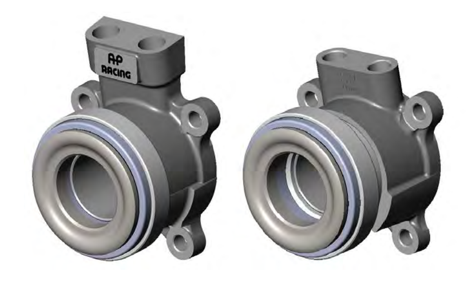
CP3859 Concentric Slave Cylinder Family